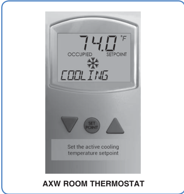
AXW ROOM THERMOSTAT