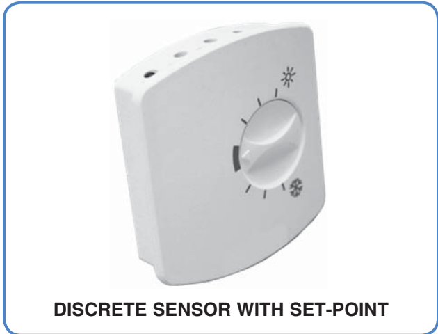
DISCRETE SENSOR WITH SET-POINT